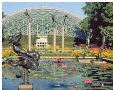
The Missouri Botanical Garden in St. Louis is among the top three public gardens in the world.

(Suggested website: www.budweisertours.com/docs/stltour.htm )