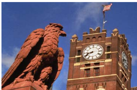
Anheuser-Busch, Inc.'s symbolic eagle stands guard outside the company's historic St. Louis Brew House.