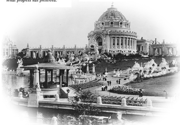
The fabled "Meet Me in St. Louis" World's Fair enchanted the world in 1904. (Suggested website: http://www.slpl.org )

P O Box 1200 Columbus GA 31902-1200 www.columbusgachamber.com